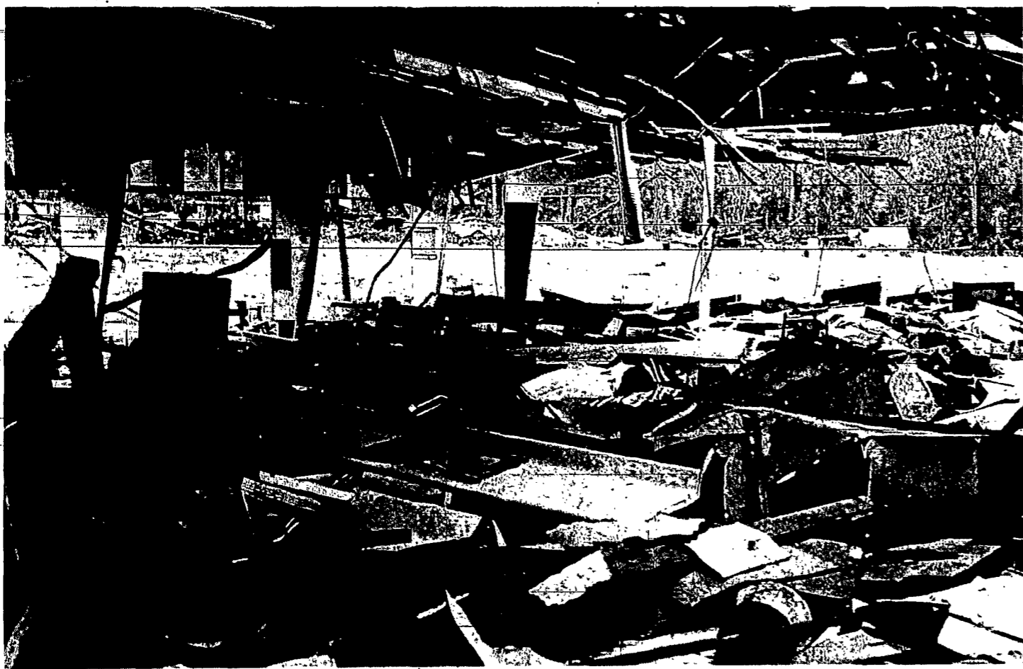
Hurricane Camille completely demolished St. Clare's School, Waveland, Miss. Books, papers and teaching supplies in the two-story building were destroyed in the August storm.