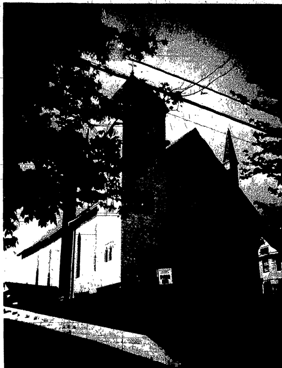
ST. VINCENT DE PAUL CHURCH, CHURCHVILLE ERECTED IN 1885