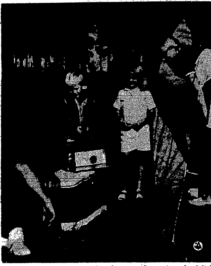
Young couples, discovering the pleasures of camping, the delight with which their children take to the adventure, and the vacation time economies to be found in the great outdoors, are accounting for a substantial part of the vast growth in ranks of those who now seek their fun in going back to nature the modern way.

Have you ever wondered why proper timing is so important to good performance? According to Champion Spark Plug Company, being only five degrees overadvanced in timing can cut 35 horses off a 200 horsepower engine.