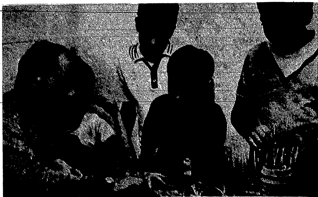
CONESUS CAMP CRAFTS—Hand craft instruction is one of the many facets of activity at Camp Stella Maris, diocesan camp on East Lake Road, Conesus Lake, which opened first of six boys' encampments this week. Two weeks' encampment for girls is scheduled from Aug. 3 to 16. Information may be obtained by calling or writing the Camp Office, 50 Chestnut St., Rochester 14604 (716/454-2030).