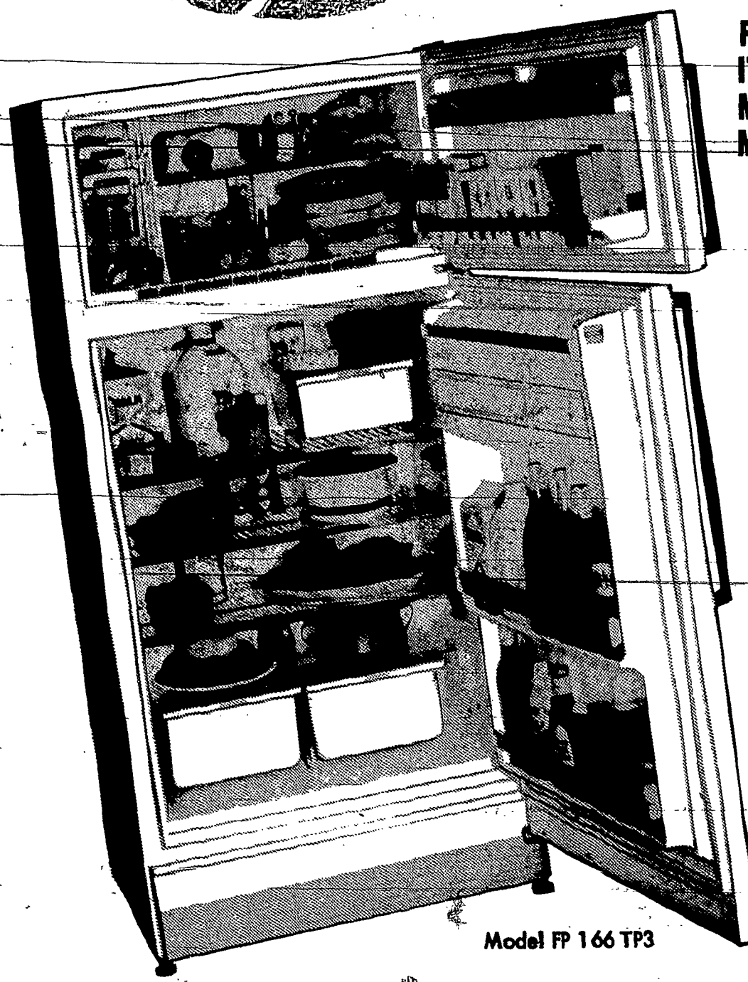
Model FP 166 TP3

FRIGIDAIRE PRICES HAVE NEVER BEEN SO LOW! NOW DURING THIS LIMITED TIME YOU WILL BE ABLE TO BUY CUSTOM DELUXE MODELS at TREMENDOUS SAVINGS. QUANTITIES ARE LIMITED and THERE WILL BE NO MORE WHEN THESE ARE GONE!