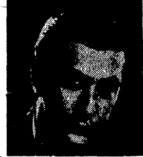
Our new vocalist