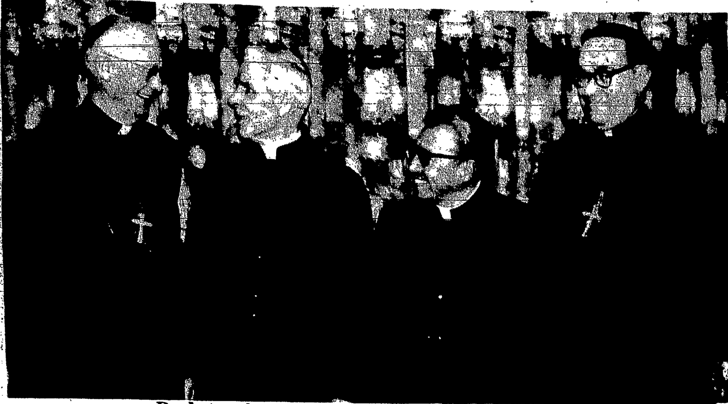
Prelates from Two Continents in Rochester