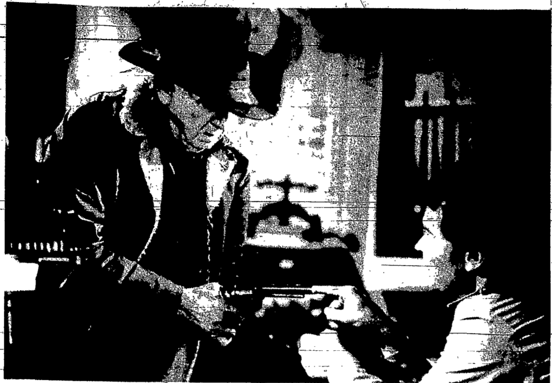
JAMES GARNER MAKING A POINT.

"If the picture has anything resembling a consistent point of view, it is one of debunking violence," concluded the National Catholic Office for Motion Pictures. "It is a refreshing viewpoint to