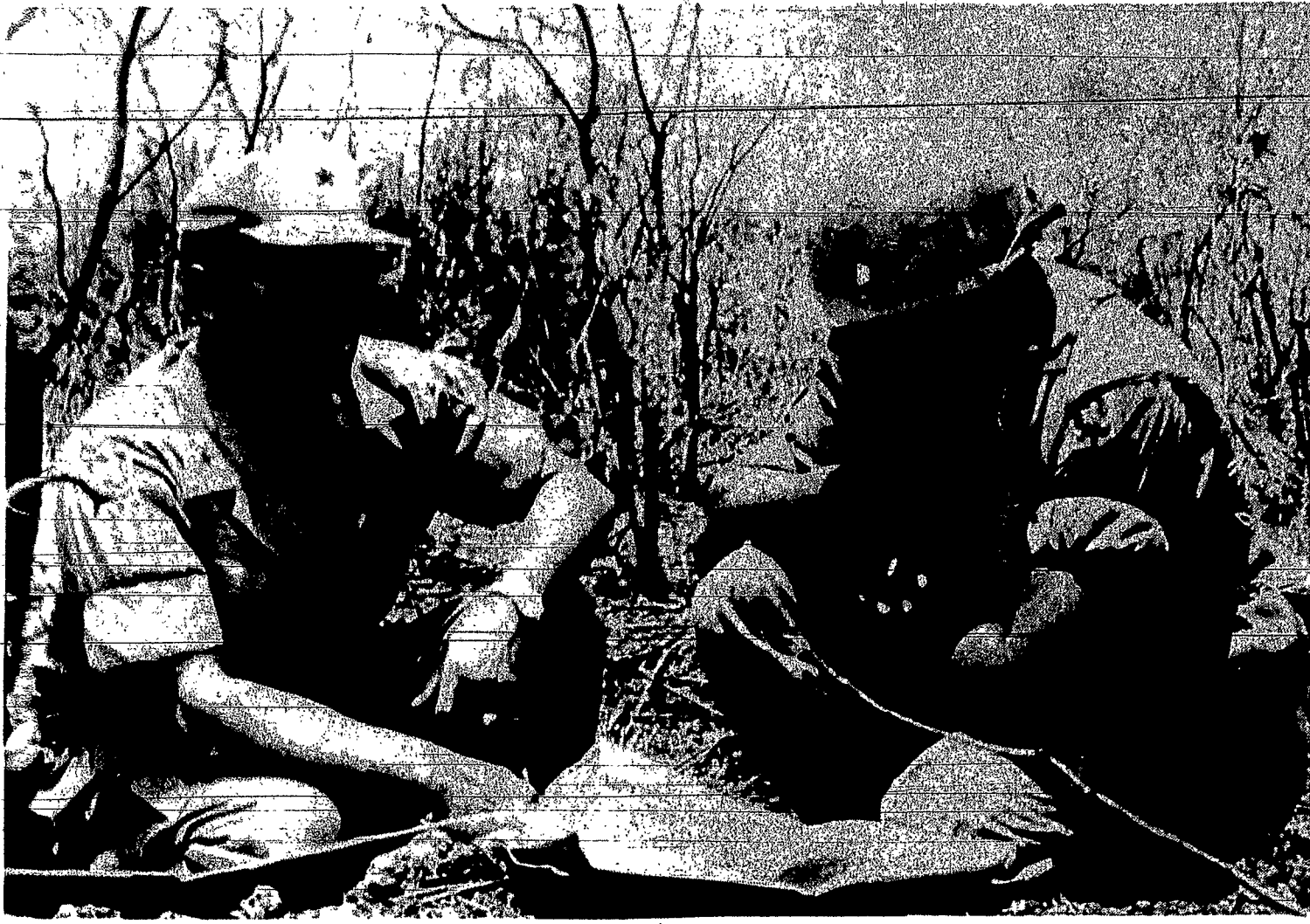
Negro Field General in Vietnam