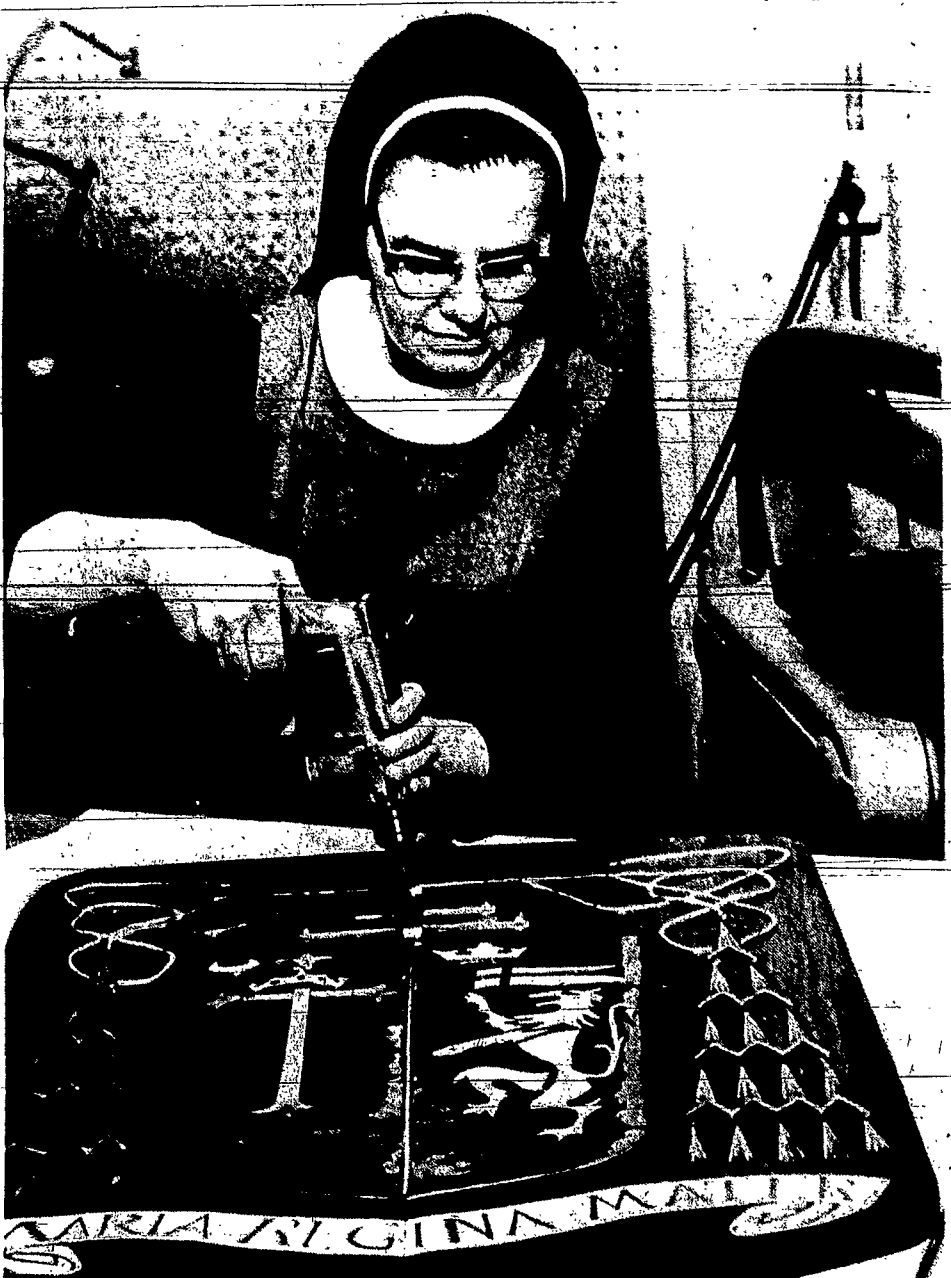
Coat of Arms for Cardinal

He said he had to veto the bill because there was a specific ban in the State Constitution against such financial assistance in the case of church educational facilities.