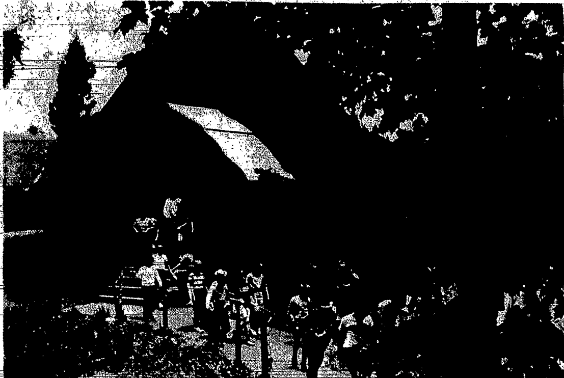
Youngsters shown leaving one of cabins at Camp Stella Maris on Conesus Lake to go on "overnight campout" which features each encampment period.