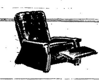
MOTHER'S DAY GIFT

"I feel that to be really well groomed, a hairpiece adds the finishing touch. And it's so easy just to 'pop' one on and have a different hair fashion whenever you want."