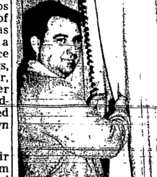
DRAPERY DRY CLEANING

BEAUTY TREATMENT for winter-dry cars. . . . Doll-up Service, Simonize, as well as complete collision service. Where the ladies get that Extra Special Attention. . . . ALLING & MILES, Inc. , 1301 Ridge Rd. E., nr. Portland 467-7260, -342-9390. (Celebrating 56 years in business)