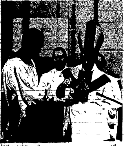
Bishop Fulton J. Sheen is shown at Holy Thursday Mass in Sacred Heart Cathedral blessing Holy Oils to be used throughout the Diocese for Baptism, Confirmation and the Sacrament of the Sick.