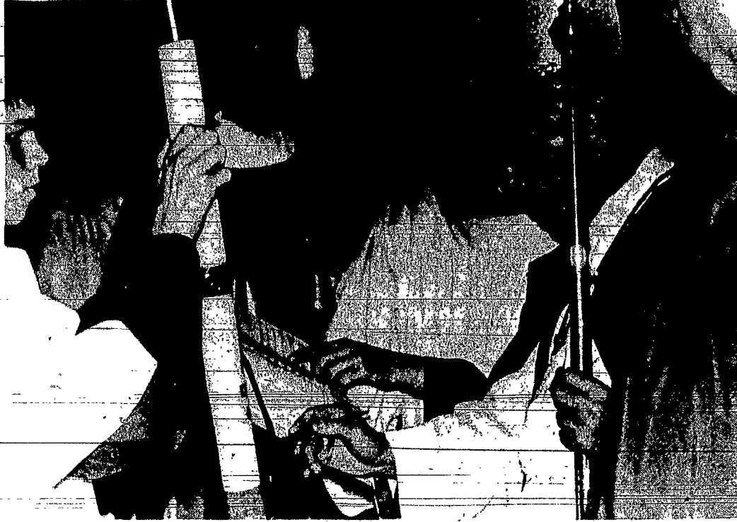
Bishop Sheen marks the year "1969" on new Paschal Candle for Sacred Heart Cathedral at Holy Saturday Vigil ceremonies.