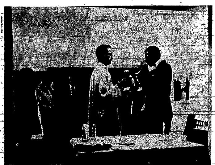
To increase neighborhood community spirit, Our Lady of Loretto Parish in St. Louis has been encouraging a program of evening Masses in the homes of parishioners. The evening begins, top, with a film strip presentation and discussion on the Mass. Then, Mass is celebrated. A special privilege of the home liturgy is the opportunity for communicants to receive the Eucharist under both species, bottom. (RNS)