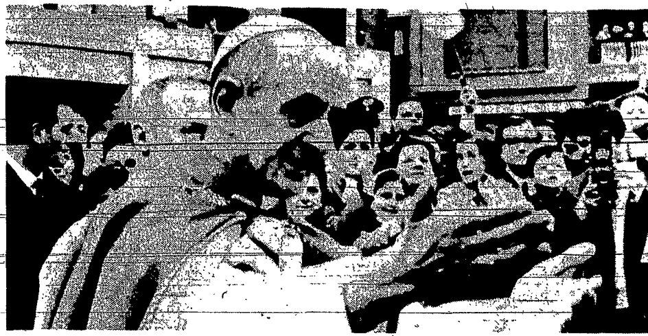
Rome — Pope Paul VI was enthusiastically cheered by parishioners at St. Pius V Church in Rome when he visited the parish for Lenten services.