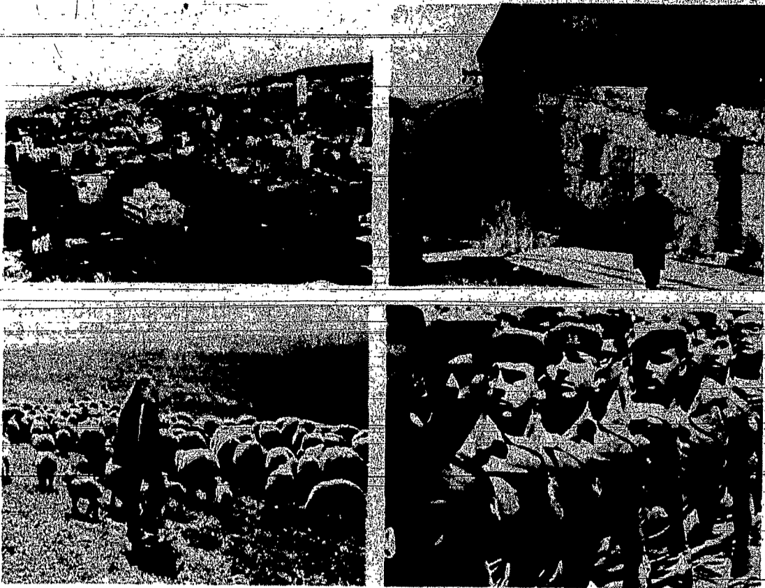
Land of Contrasts

The senator discussed experiences from his recent trip to Biafra and exhibited pieces of shrapnel that he said came from a Nigerian bombing raid on a Biafran Catholic church in which 105 persons were killed.