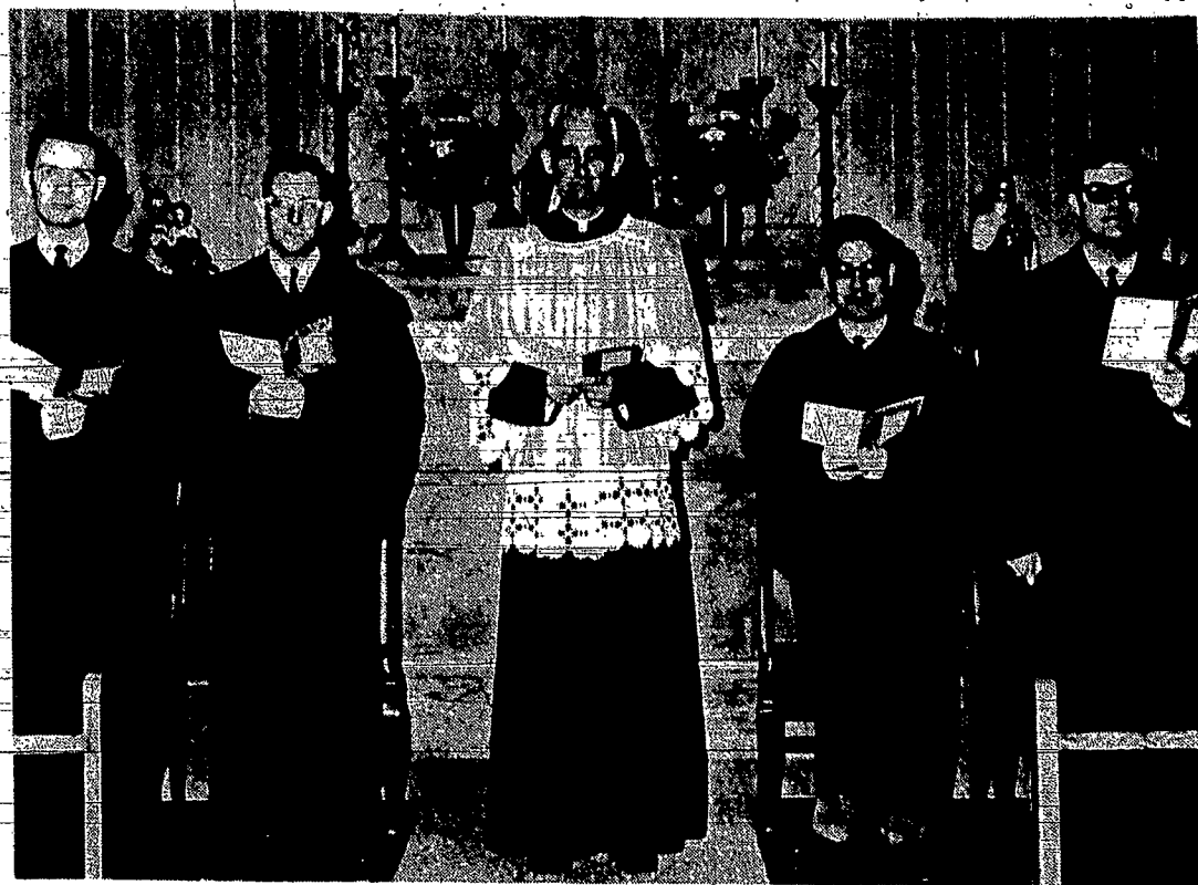
Christian Unity Service in Newark Valley