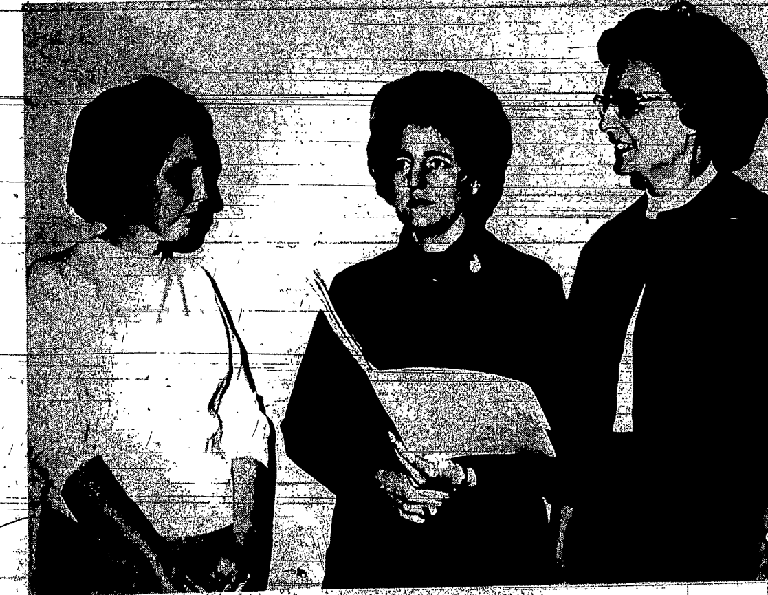
Planning Dance in Corning