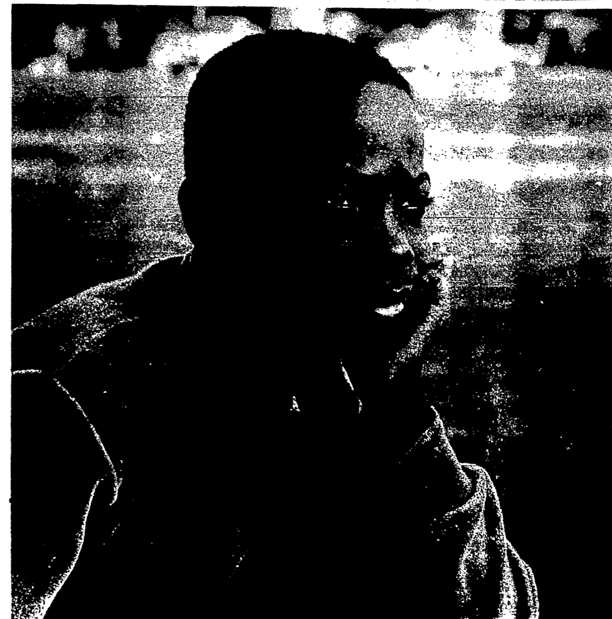
What does future hold for Inner City children?

Summer seminar on urban problems and decision-making