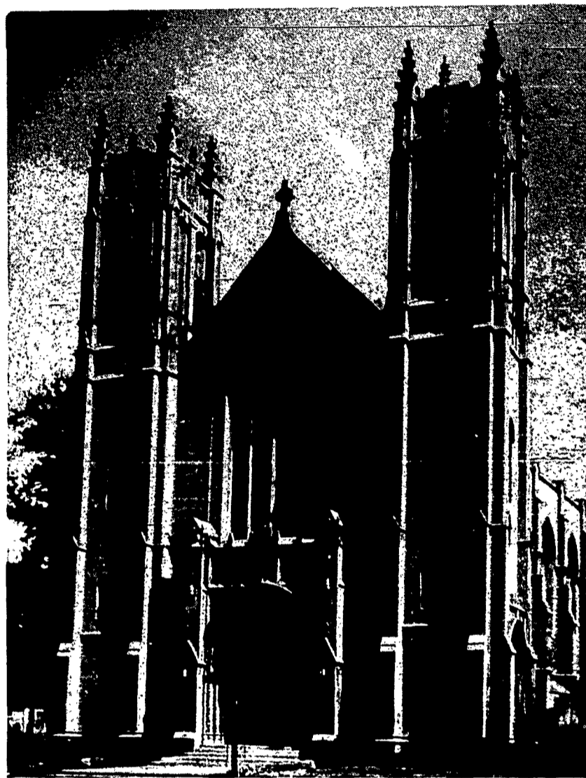
Sacred Heart Cathedral, erected in 1927, succeeded St. Patrick's as the Cathedral of the Diocese in 1952.

In December, 1966, Bishop Fulton J. Sheen was formally installed there as the sixth Bishop