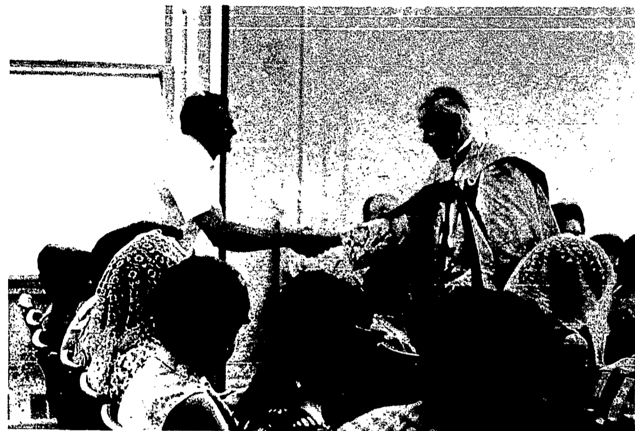
Bishop Sheen chats with Latin Americans on his first visit to Concordia Hall on Clifford Avenue, the center of the diocesan Spanish Apostolate.