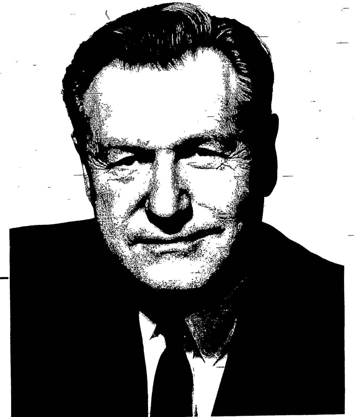
Governor Nelson A. Rockefeller