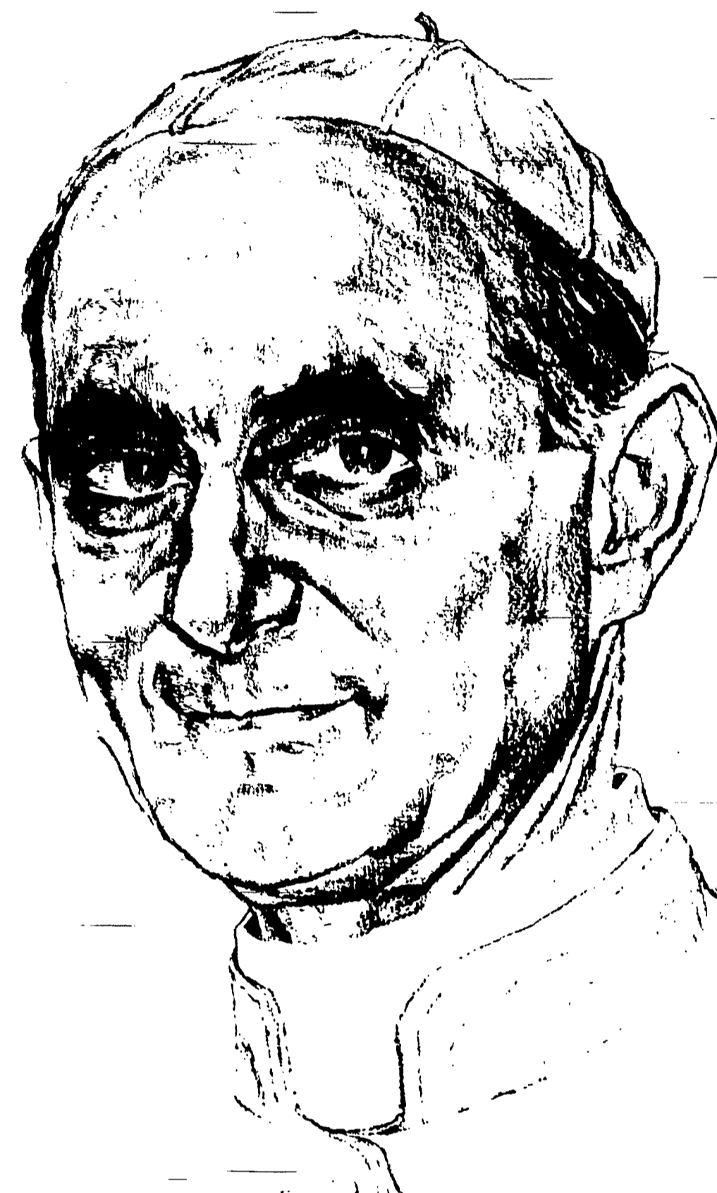
Pope Paul VI

Born in Concesio, Italy, Sept. 26, 1897 Crowned Pope, June 30, 1963