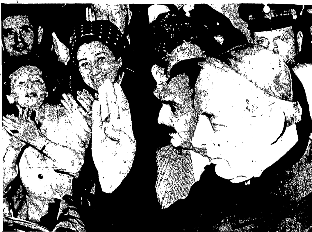
Stefan Cardinal Wyszynski, Primate of Poland, was welcomed by an enthusiastic crowd on his arrival in Rome for his first visit in three years. The cardinal, who is expected to stay in Rome for several weeks, will confer with Pope Paul VI and Vatican officials on the condition of the Church in Poland.

Cardinal Koenig visited the traditional holy places here, a kibbutz and the shrine where the Dead Sea Scrolls are preserved.