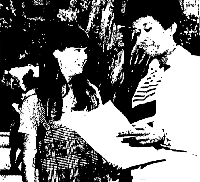
Credit for Inner City Work

Some 700 Negro churchmen from a variety of U.S. denominations attended the second annual meeting of the NCNC. Among actions taken was a unanimous vote to