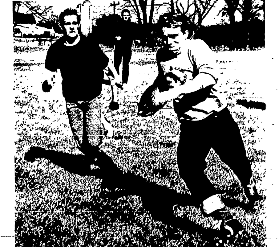
Physical fitness is important in missionary work. Seminarians toughen up on football during break in studies, good training for the action lives they'll lead as Columban Fathers.