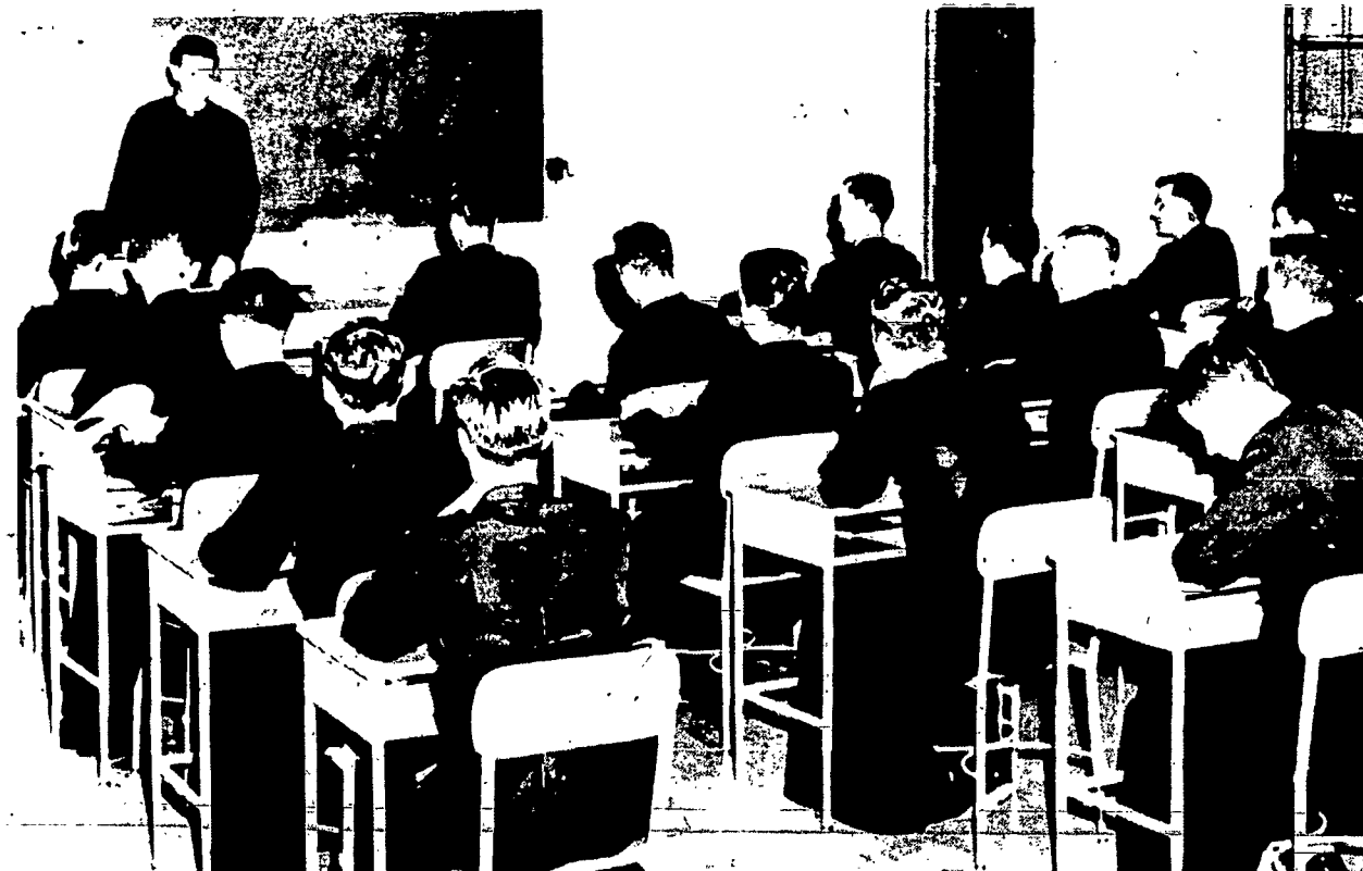
There currently are 289 young men studying to become Columban Fathers. Following ordination, this class will be assigned to one of the 2000 parishes and mission stations manned by the Society. With more than 2 million Catholics to care for, there's always room for more priests!