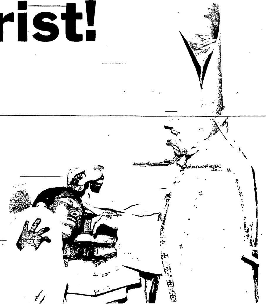
Archbishop Harold Henry of Korea baptizes a convert. Columban ranks now include 2 Archbishops, 7 Bishops, more than 900 priests.