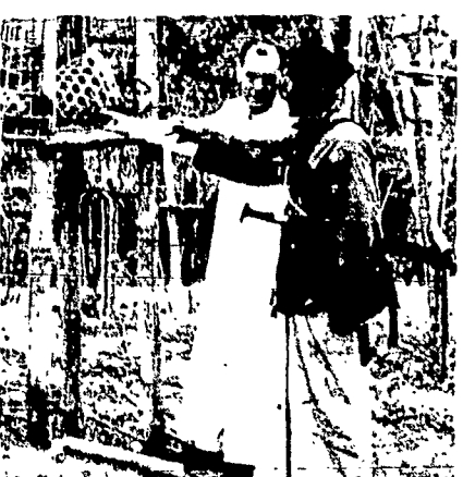
Mountain tribesman in northern Burma looks to his Columban missionary friend for advice on village matters as well as spiritual guidance.