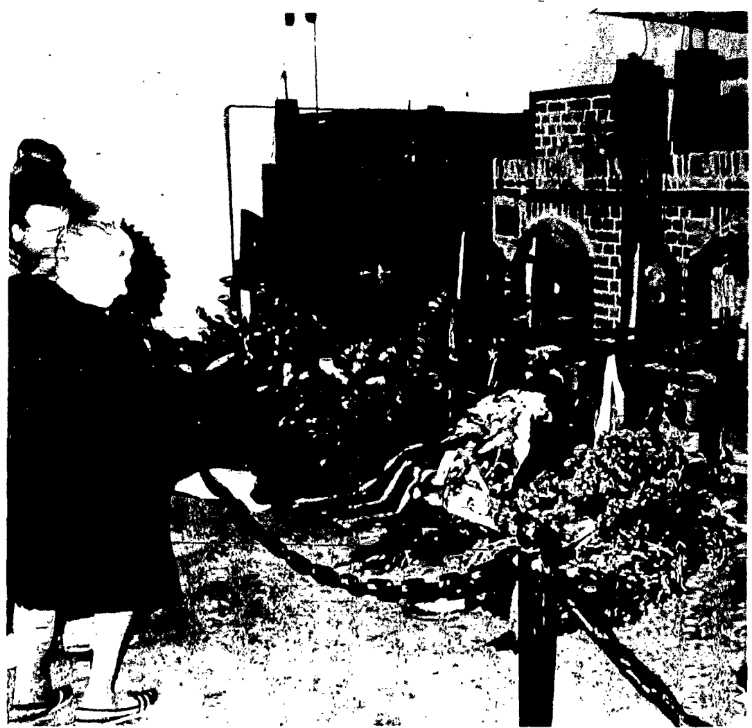
Modern sculpture unveiled at the Dachau concentration camp near Munich is memorial to prisoners who died there during World War II. Some of the 2,000 who attended the memorial services place wreaths in front of the exterminating gas ovens in infamous "Barracks X". At right is a synagogue, one of three houses of worship on the site.