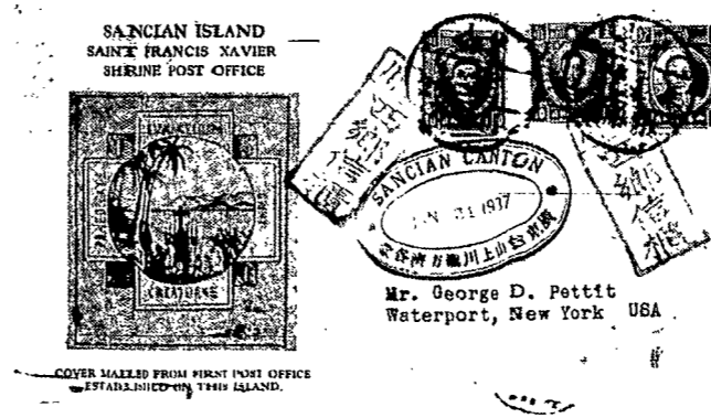
This cover was mailed from the first post office on the island of Sancia, 15 miles off the coast of China. The post office for pilgrims to the Shrine of St. Francis Xavier who founded the mission there.

The Rochester Diocesan Catholic Guidance Council will meet at 7:30 p.m. Wednesday, Sept. 25, at St. Agnes High School. The theme of this year's discussions will be "Communication." All guidance personnel and others interested are invited to attend.