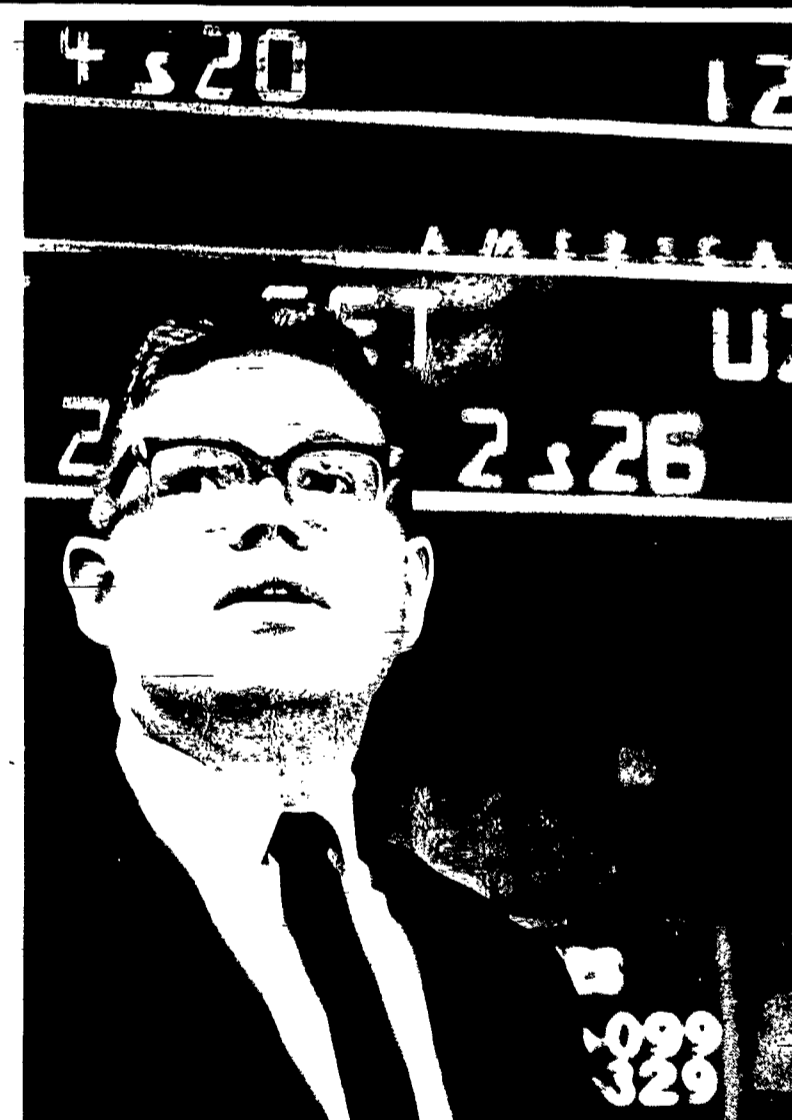
Advance within the company?