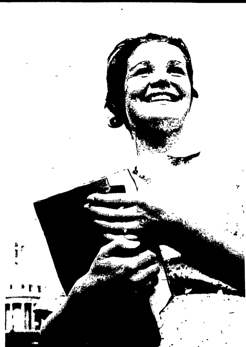
Or just to learn more about a subject of interest

There are lots of good reasons why people enroll in evening classes at the University of Rochester. What's yours? Register early for classes.