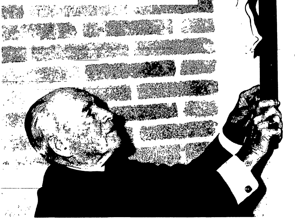
Bishop Kearney's role as a builder cannot be symbolized better than by this photo showing that he always personally hung the first crucifix in a new diocesan or parochial building.