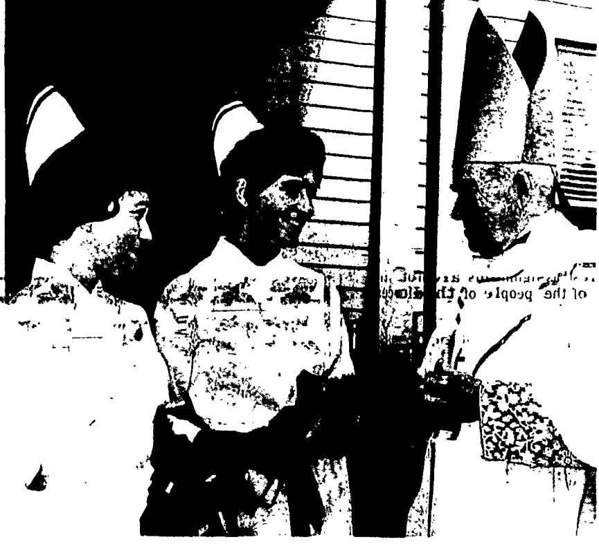
Priestly concern for the sick includes respect for nurses, doctors and hospitals. Bishop Kearney's presence at nurses' graduations always gave pleasure and inspiration.