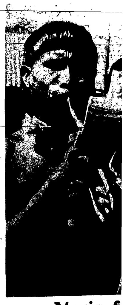
Music f Deep in the South American j instruments and Christian hy

The 1,000 persons attending t service pleaded with the U.N. me ber nations to intervene in the stri gle between Nigeria and its form