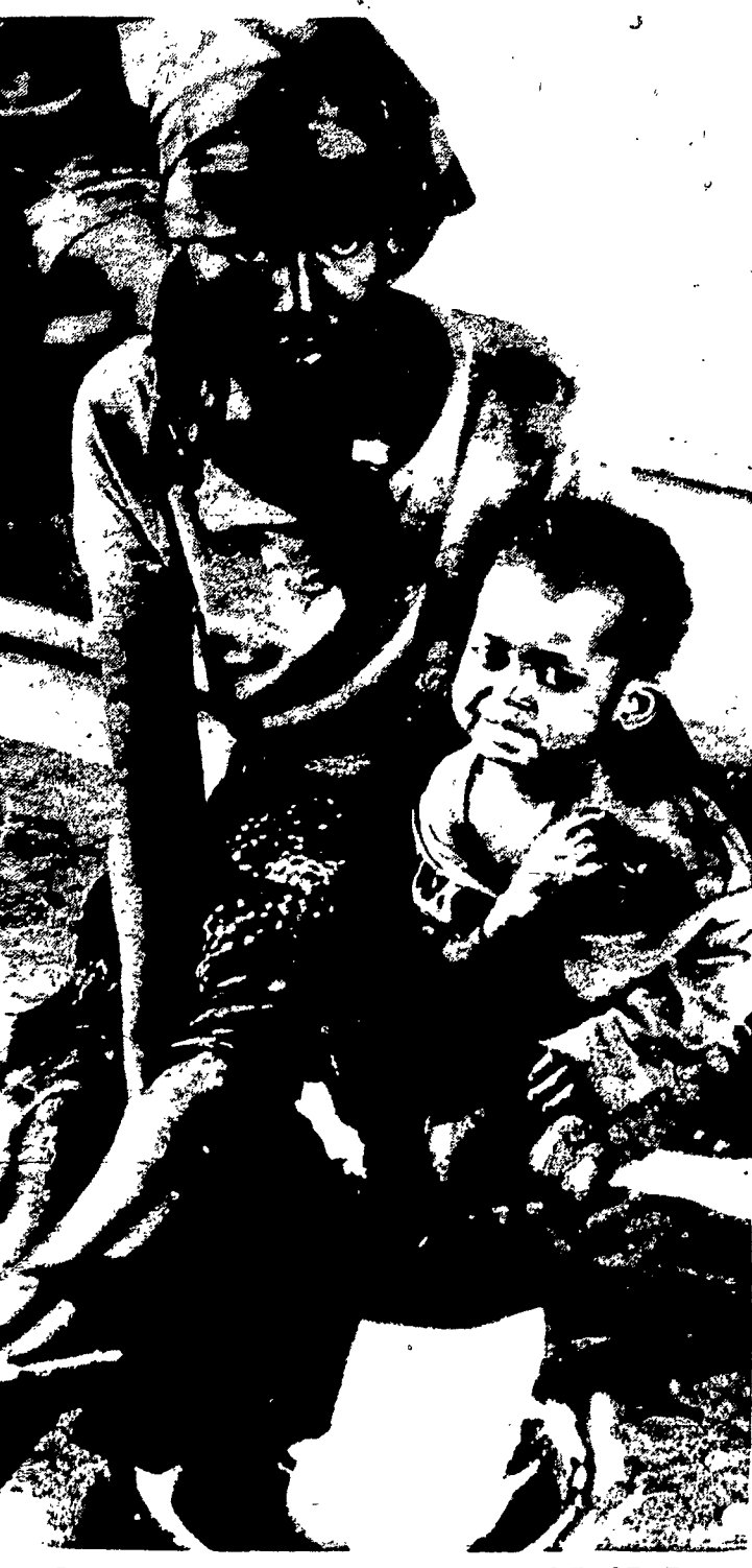
Hungry Biafran Child

The ambassador said his government remained determined to shoot down any plane flying into Biafra without authorization. He said that (Catholic) Caritas' plea to allow its planes to fly during daytime was rejected. Some food is getting into the rebel