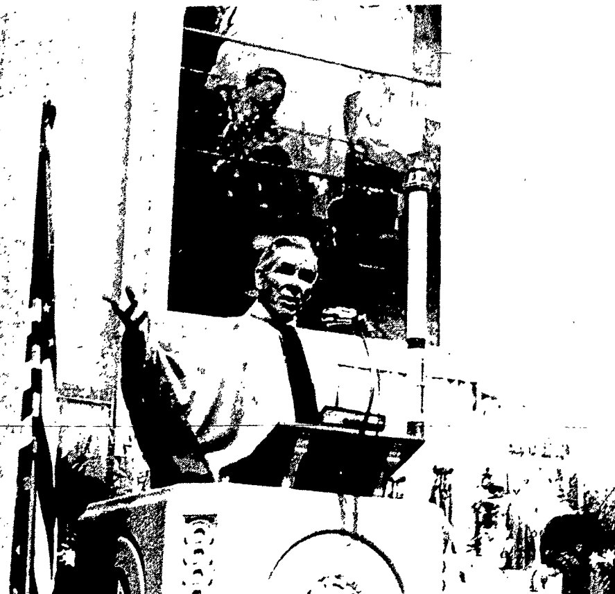
and to send 8 1/2% of His Board of Directors scurrying?

Jesus had made His "greatest mistake." He lost public opinion, He lost "Christians" and disciples, and He splintered His Apostolic band. But He knew He would lose. If He flew in the face of the world and the worldly. And He did! From now on the Heart of Jesus has a cross in it. But is Life really that sacred that He could afford to lose the masses, to wreck an organized discipleship.