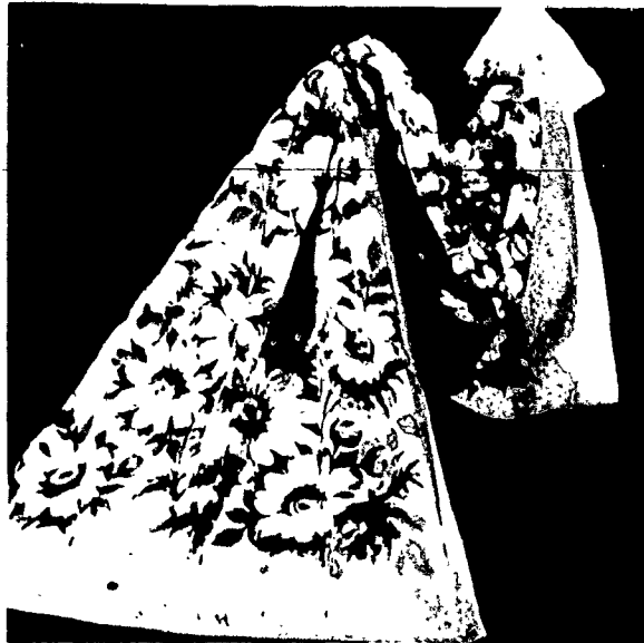
"Fresh Daisies" bath towel