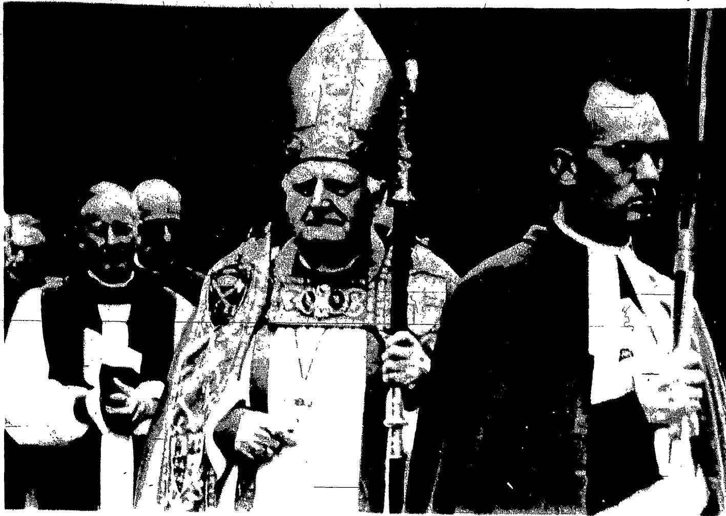
Archbishop Michael Ramsey of Canterbury, England, head of the worldwide Anglican Communion, enters Canterbury Cathedral to open the 10th Lambeth Conference. The decennial gathering has brought 462 Anglican bishops together for sessions extending over a month.