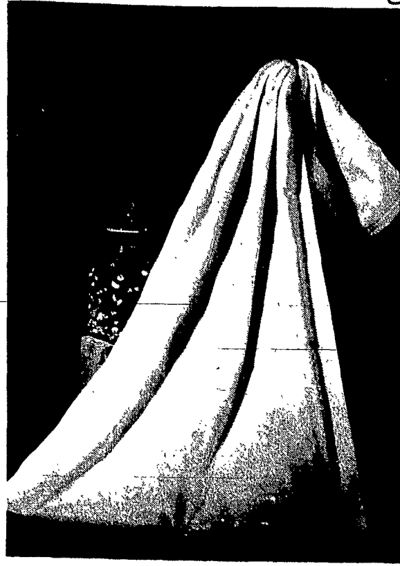
"Radiance" bath towel