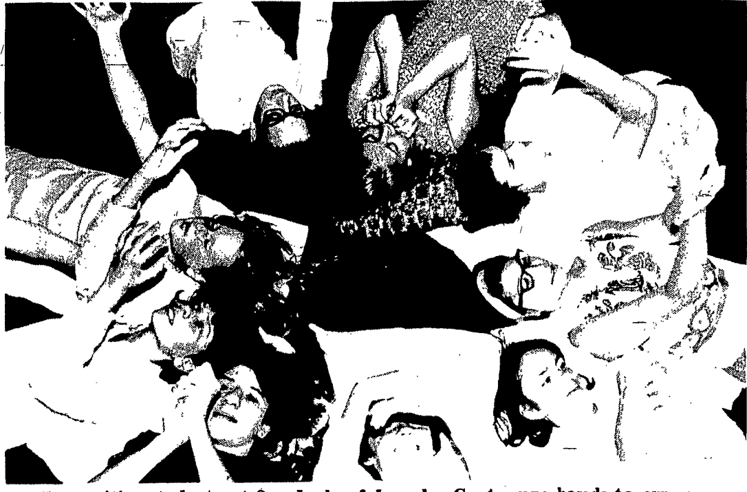
Humanities students at Our Lady of Lourdes Center use hands to express emotions of kindness (girl in center at bottom), others, moving clockwise: sadness, kindness, joy, joy, fear, shame, joy, anger.

HELP! Need workers? We have them! Young men of the inner city for general maintenance-cleaning, lawn care etc. If you wish to help and hire them for a minimum of 3 hours at a minimum wage of 1.25 per hour— Call "Mike" Ordway 454-2030 CVO Job Placement Daily 9 to 5