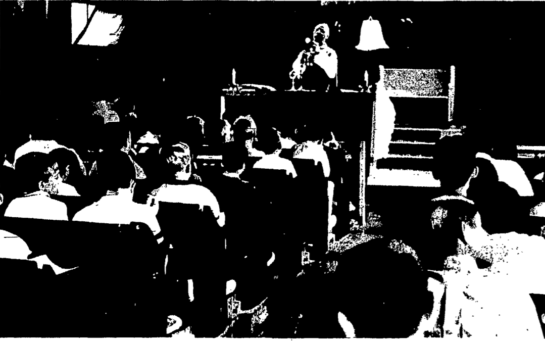
Daily Mass in The Rustic Chapel

These four pictures of activity at Camp Stella Maris, diocesan boys camp at Conesus Lake, show a few appealing features of the experience available to 180 boys each week. Space is available at the Camp office, 50 Chestnut Street, for enrollments beginning July 14, 21, 28 and August 4.