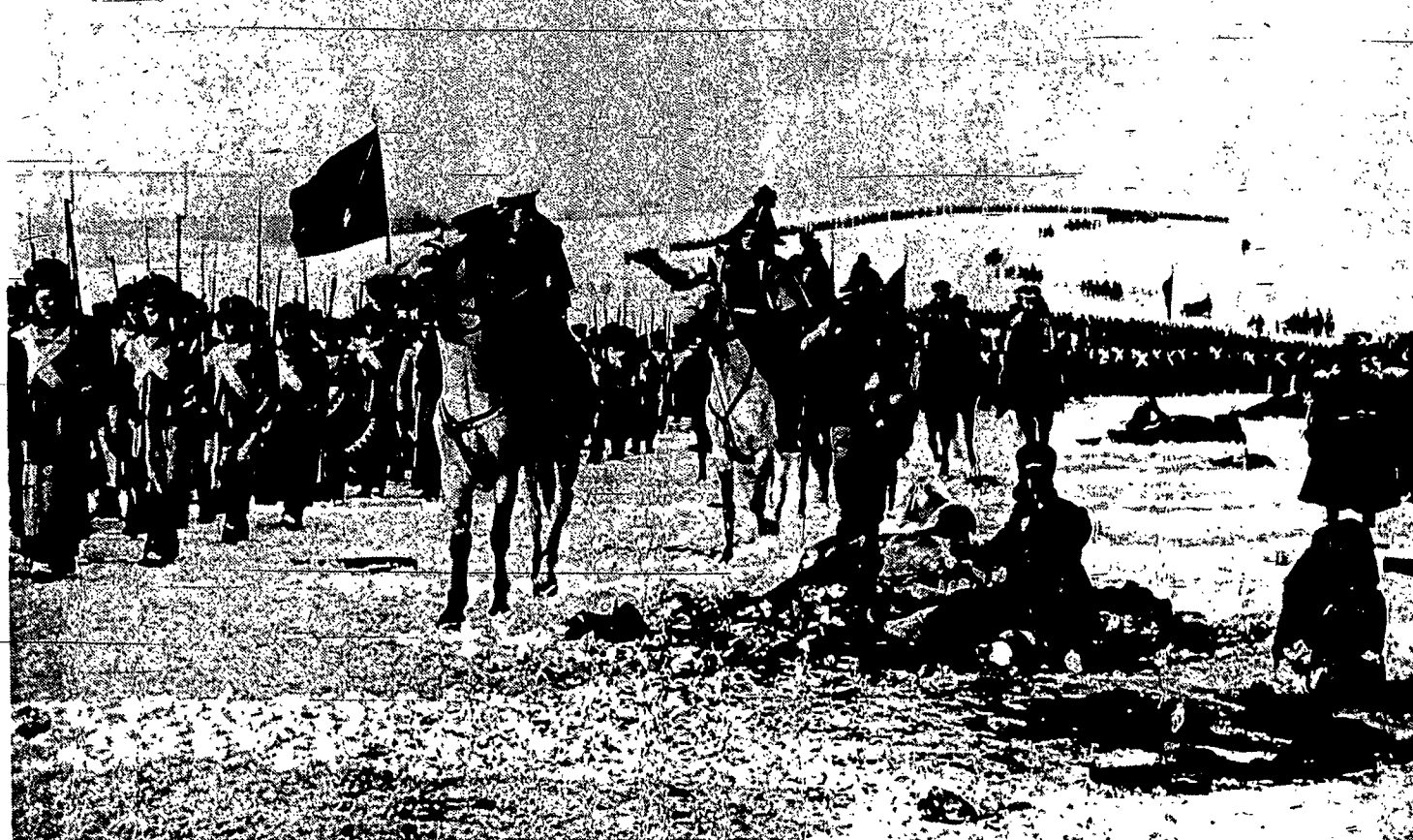
Russian troops are led away from Moscow, leaving the city to Napoleon, in scene from "War and Peace."