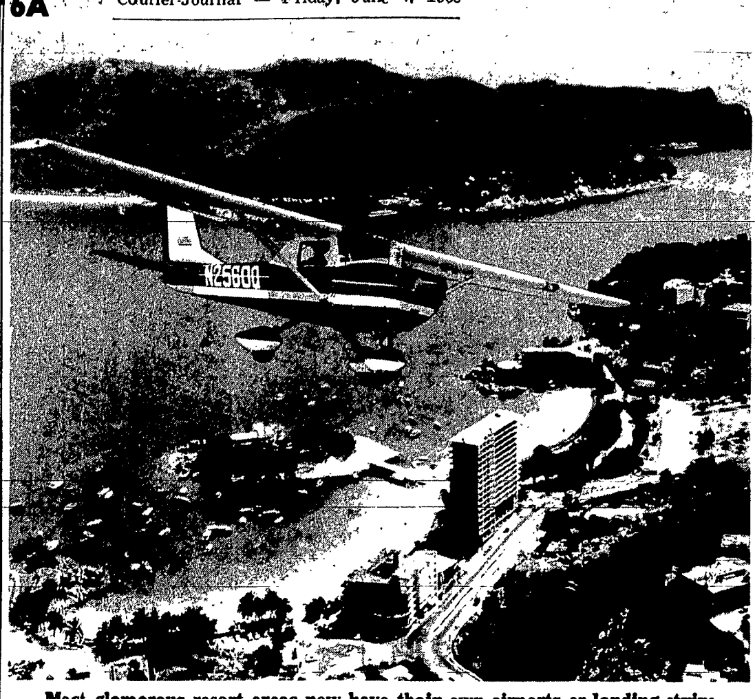
Most glamorous resort areas now have their own airports or landing strips for the convenience of the increasing number of private plane operators, whose party of friends is thrilled by views such as this from a single-engine Cessna circling the picturesque vacation area before landing.