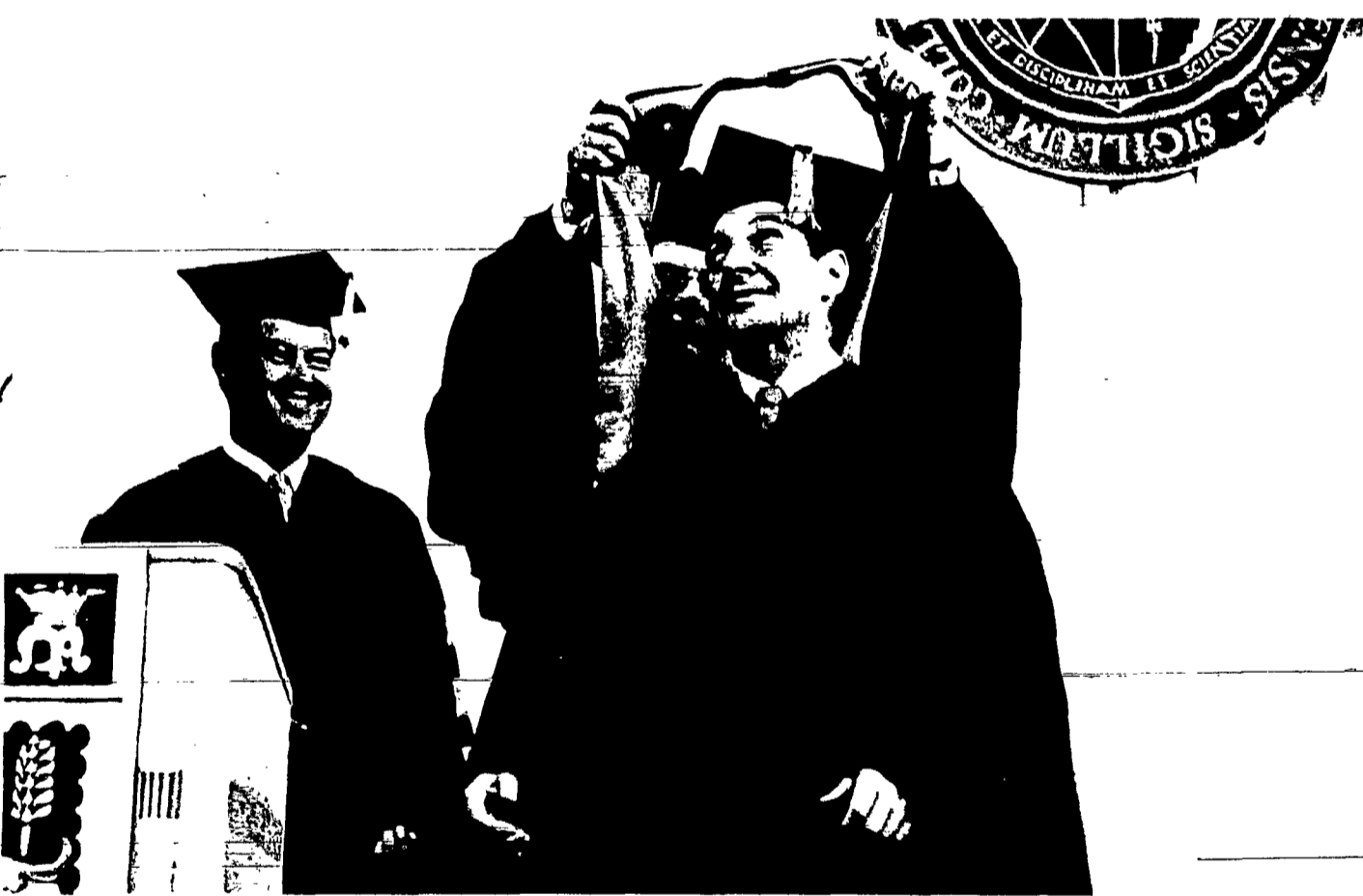
Ambassador Sol Linowitz, Organization of American States, receives the hood of an honorary Doctor of Laws from St. John Fisher College. Former