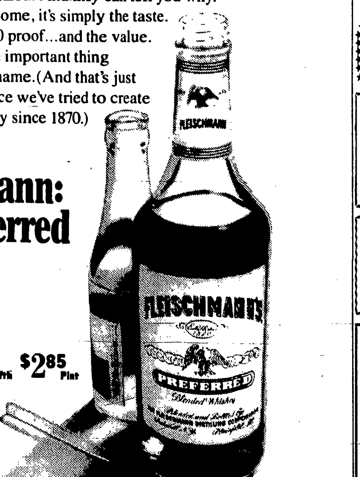
THE FLEISCHMANN DIST. CORP., N.Y.C. — BLENDED WHISKEY — 90 PROOF — 65% GRAIN NEUTRAL SPIRITS

90 proof. As fine a whiskey as money can buy. $5.65 Quart, $4.55 Pint, $2.85 Flat.