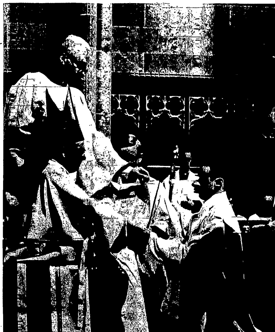
Next Saturday morning Bishop Sheen will anoint the hands of ten new priests of the diocese in a ritual like this. As he marks a cross with holy oil on the opened palms of each young man, the Bishop says: "Be pleased, Lord, to consecrate and sanctify these hands by this anointing and our blessing. That whatever they bless may be blessed and whatever they consecrate may be consecrated and sanctified."

All of the new Rochester priests attended the former minor seminary, St. Andrew's, as well as St. Bernard's. All but one are from the city.