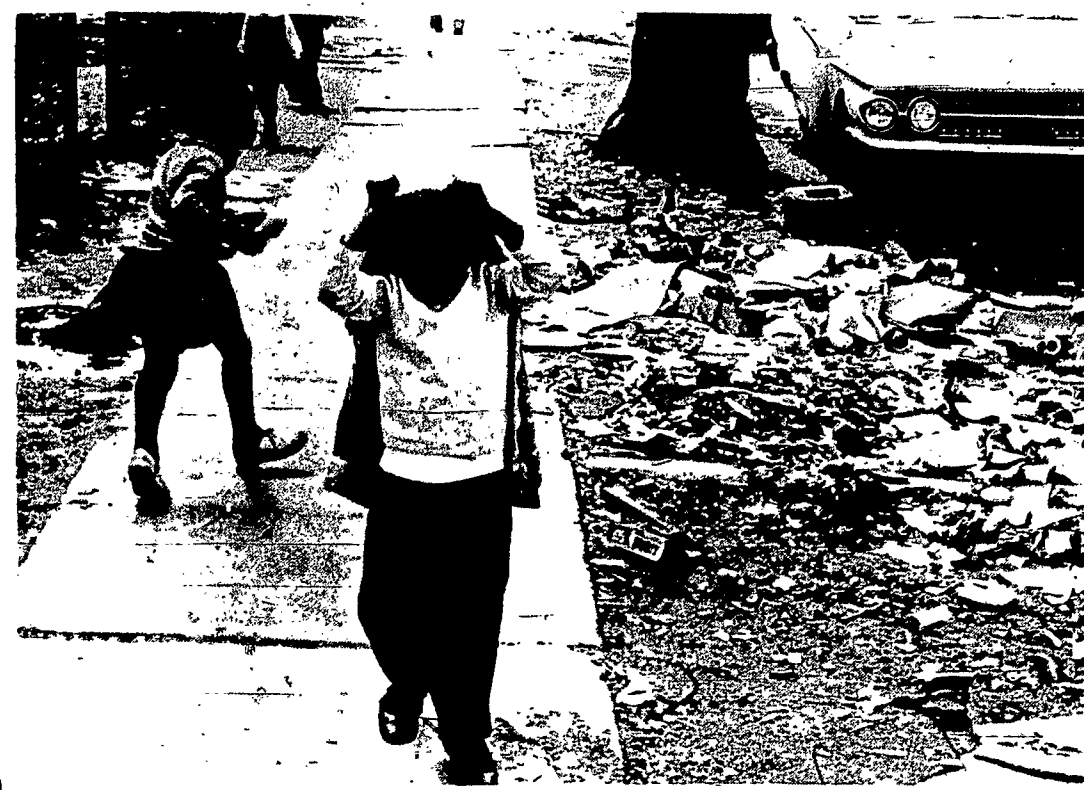
Kids say: "It's no fun to play in garbage." Slum-debris, scattered on many inner-city streets, adds to the depression of underprivileged families.

Genesee and Charles Settlement Houses —Neighborhood family and youth centers with