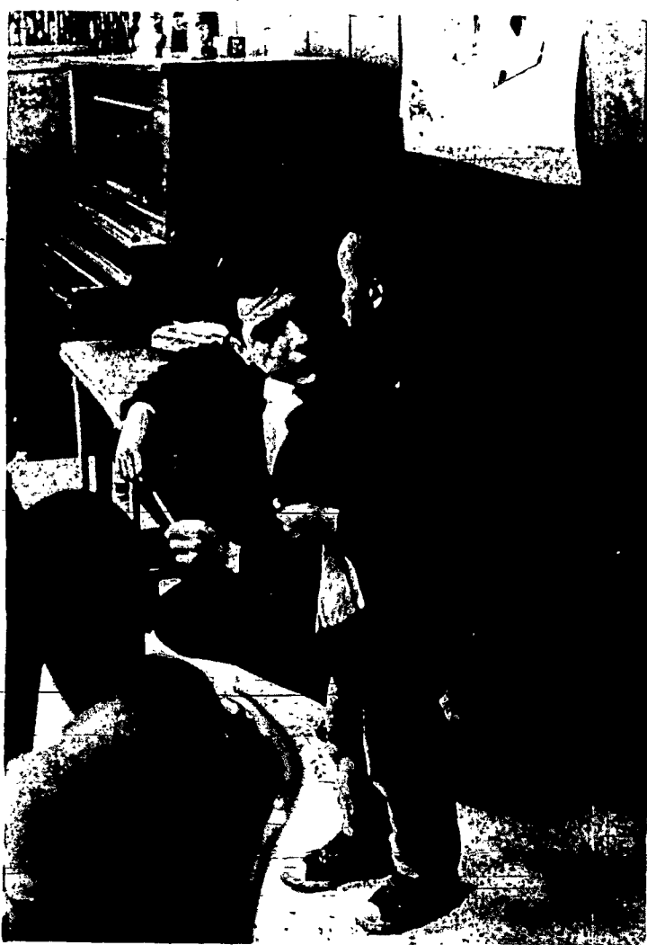
A staff member at Genesee Settlement House encourages a boy to get into a group-game. This house offers recreational, educational and social work in the Bay Street area of Rochester.