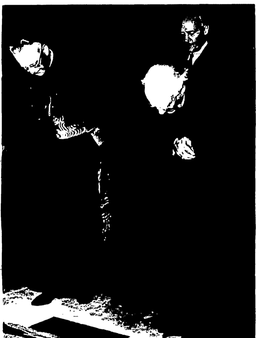
London —John Cardinal Heenan, Archbishop of Westminster (left), and Anglican Archbishop Michael Ramsey of Canterbury bend heads to read plaque in floor of Westminster Hall commemorating the trial of Sir Thomas More, 16th Century martyr to his faith. Sir Thomas More was condemned to death for high treason at the trial in Westminster Hall in 1535.