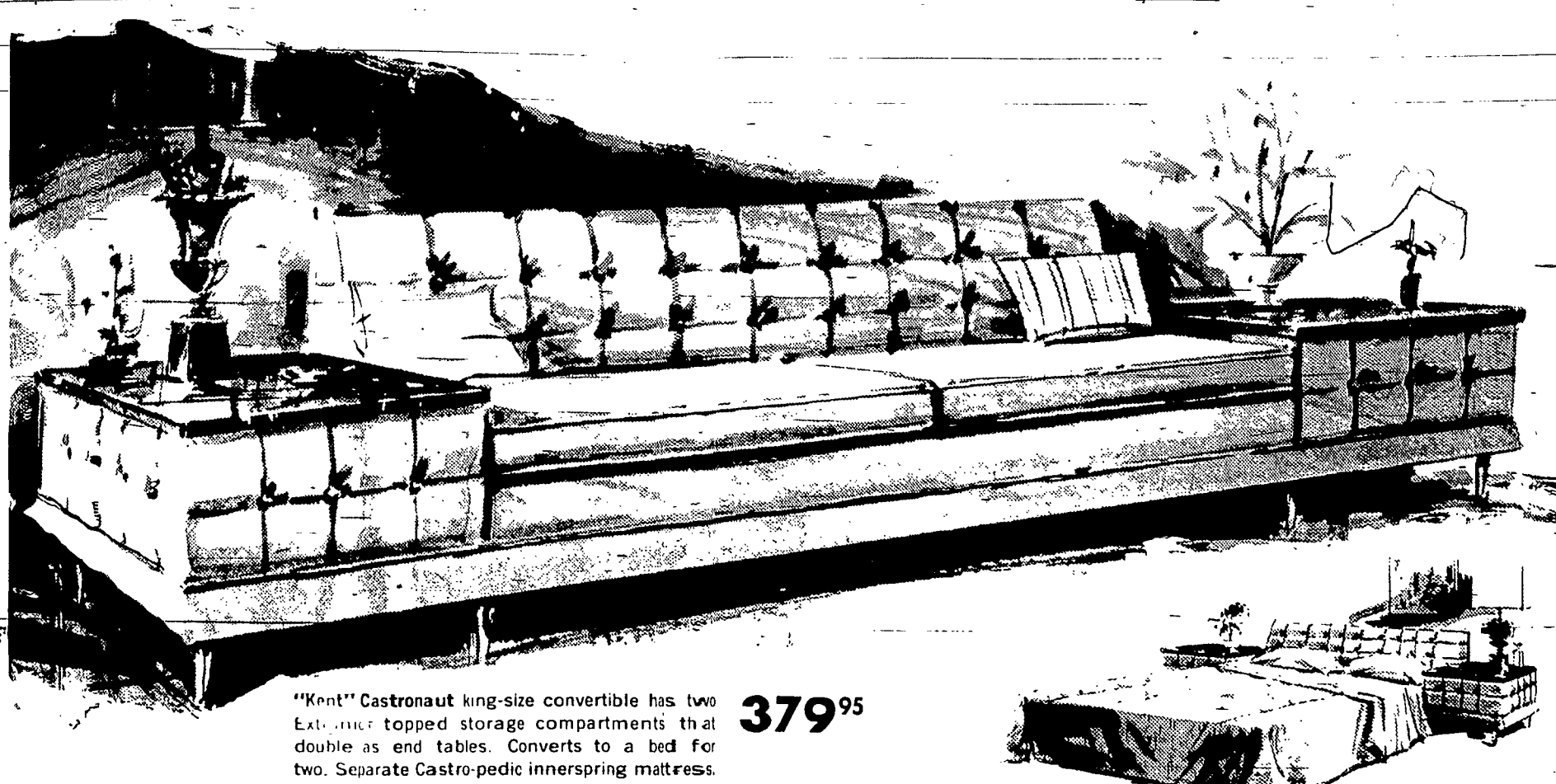
"Kent" Castronaut king-size convertible has two extra-topped storage compartments that double as end tables. Converts to a bed for two. Separate Castro-pedic innerspring mattress. 379.95

For 36 Years, America's Largest Manufacturer of Convertible Furniture Selling Direct to You. CASTRO... FIRST TO CONQUER LIVING SPACE