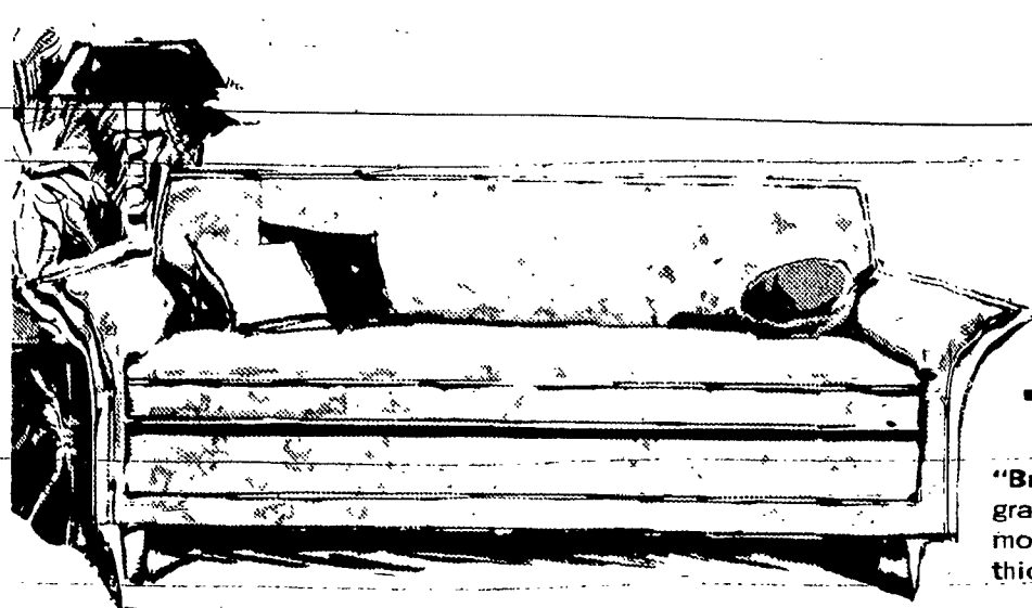
"Bristol" Castronaut twin convertible sofa has graceful lines, flair-out arms, and a Contemporary mood. Converts to a most comfortable bed with a thick separate Castro-Pedic innerspring-mattress. 199.95