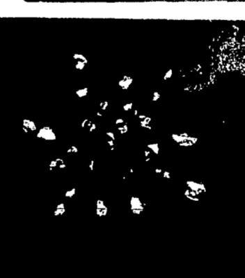
Heather, violets and white roses charmingly styled in the colonial tradition.