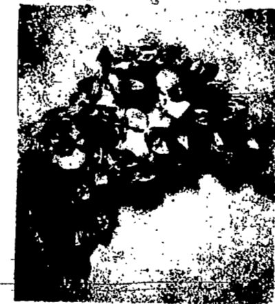
A crescent of lovely white phalaenopsis orchids and white roses.