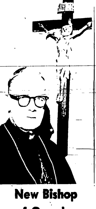
New Bishop of Camden