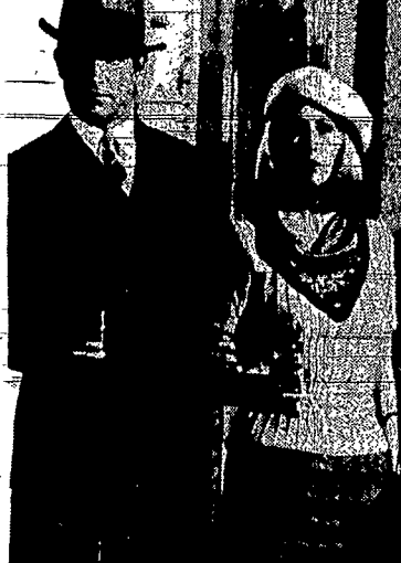
Top honors in NCOMP's 11th went to "Bonnie and Clyde" (far right). The Ca

Rochester's top entries are Our Lady of Mercy, which took the high school CYO crown, and St. Thomas the Apostle, which walked off with the grammar school title.