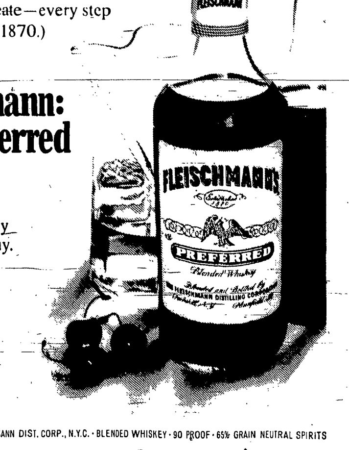
THE FLEISCHMANN DIST. CORP., N.Y.C. - BLENDED WHISKEY - 90 PROOF - 65% GRAIN NEUTRAL SPIRITS