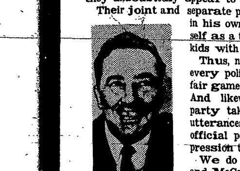
Senator McCarthy expects defeat