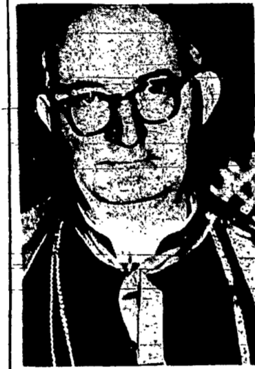
NEW PRO-PREFECT of the Doctrinal Congregation is Yugoslavian Cardinal Seper, left. He succeeds Cardinal Ottaviani, right.

Sibley's Linens and Bedding, Third Floor, Irondequoit, Eastway, Southtown, Newark, Greece Sibley's Downtown Store Open Tuesday and Thursday Nights 'Til 9. Sibley's Suburban Stores Now Open Monday Thru Friday Until 9:30 P.M.