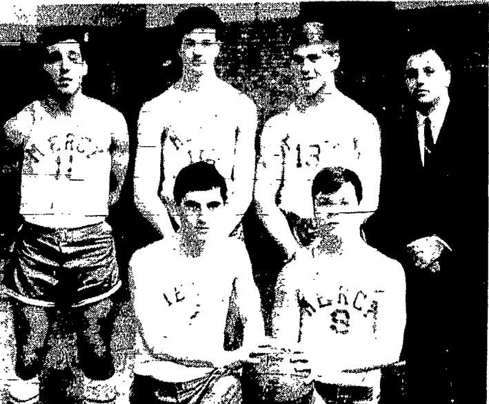
UNDEFEATED. High school five of our Lady of Mercy parish continued their win streak against Holy Cross last Sunday.

What is the cause of a persistent sore throat in an adult who has had his tonsils taken out?