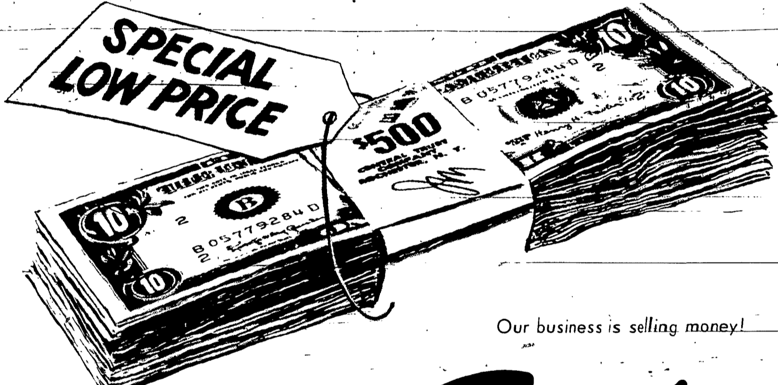
Our business is selling money!

At Central Trust ... we want everyone to have a less expensive New Year!