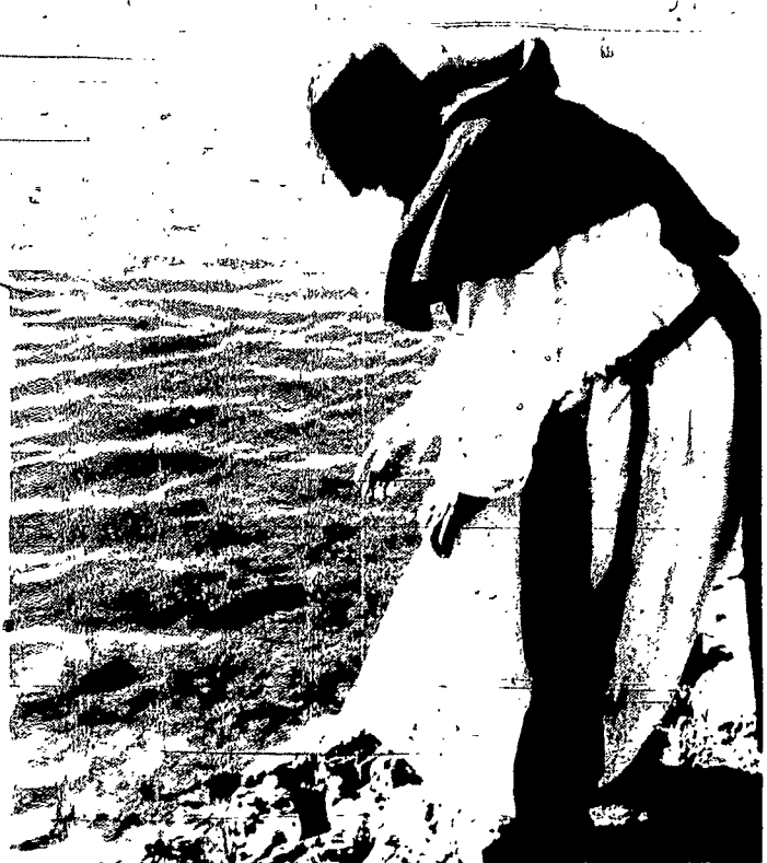
Brother Antoninus in a photo taken by Thomas Merton.

What is making an impression is the steady body of poetry that Brother Antoninus has been producing—beginning with a 1948 volume called "The Residual Years," "The Crooked Lines of God" in 1959, "The Hazards of Holiness" in 1962, and his latest, "The Rose of Solitude."