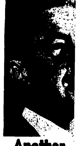
Another in Ring

The former Minne nor made a series ances around the c 1966 and 1967 speak Vietnam issue. The sponsored by the Un tian Missionary Soci Christian Churches