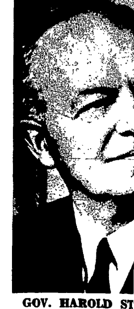
GOV. HAROLD ST

New York — (RNS) prominent American men have announced a bid for the 1968 Presidential nomination. Gov. George Romney, a former president of the Detroit Stake (di the Church of Jesus the Latterday Saints) and onetime Minnesota Harold Stassen is president of the Americanist Convention. Gov. Romney, a Mormon missionary at age 18, resigned