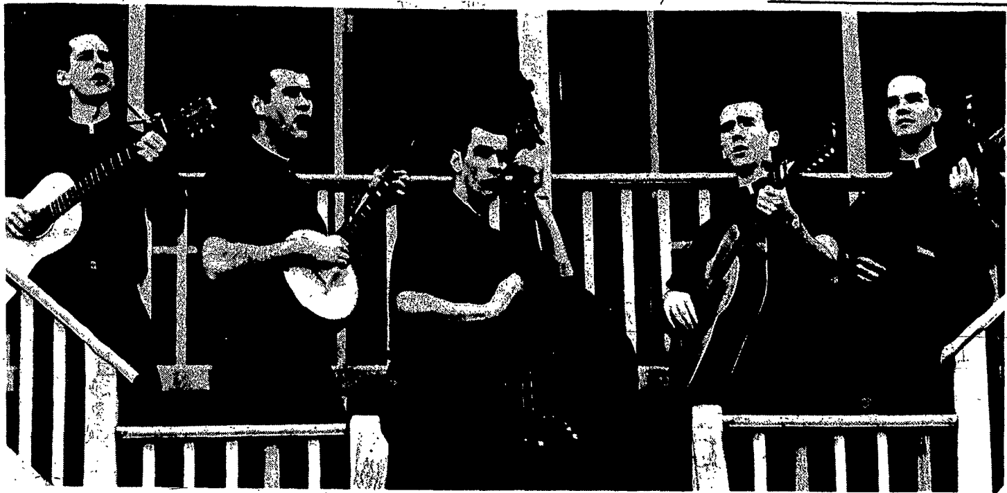
SINGING APOSTLES. The five seminarians who make up the Montfort Mission are assigned to inner-city work in St. Louis. They've recently waxed

an album called "Yesterday's Gone," a collection of songs dealing with today's youth, social problems and the Christian conscience.