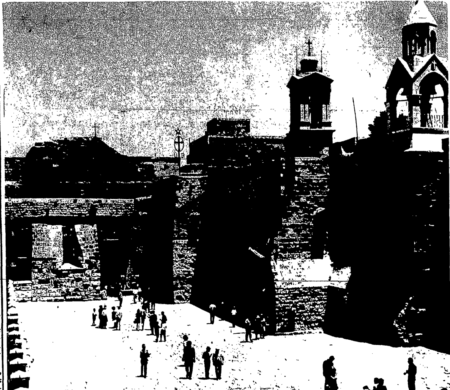
Bethlehem Nativity Square

He urged the UN to "take the necessary steps to accelerate the independence of the people of Mozambique."